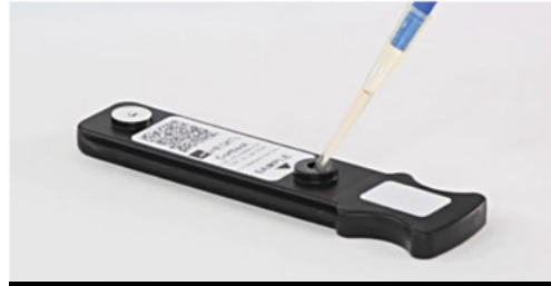
2 Load Patient Sample