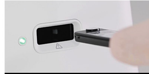
3 Insert Cartridge