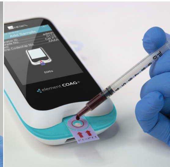
1 Enter Patient Information