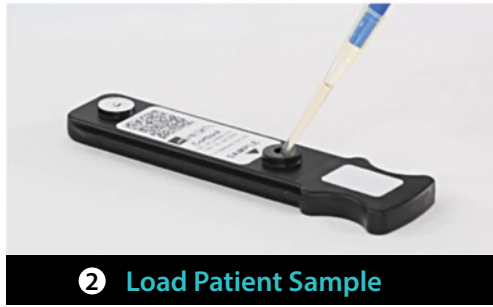
2 Load Patient Sample