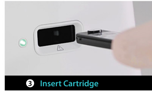
3 Insert Cartridge